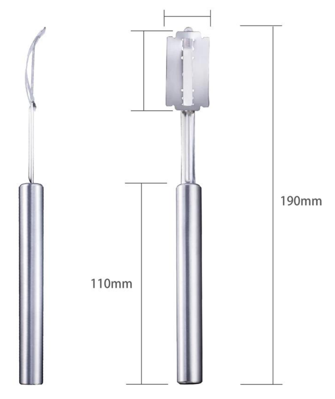
Handle Diameter: 12.7mm