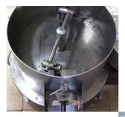
Large cooling tray with high power motor, cooling rapidly within 1-2 minutes, can fasten the coffee flavor