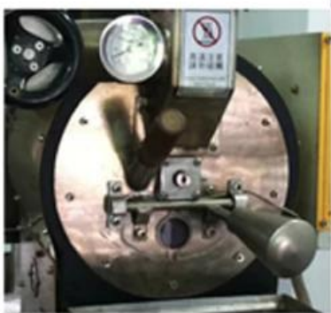
Window to see inside of the drum, you can see the change of the coffee color directly.