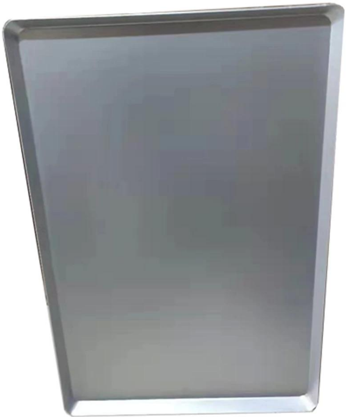
Round Corner 60x40cm of China perforated baking tray factory