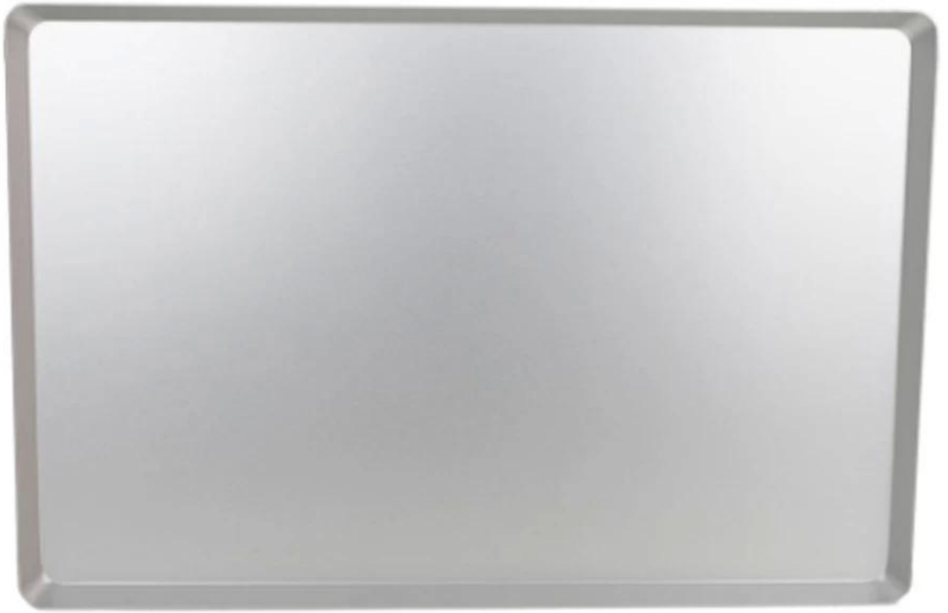
Right Corner of China Baking Tray