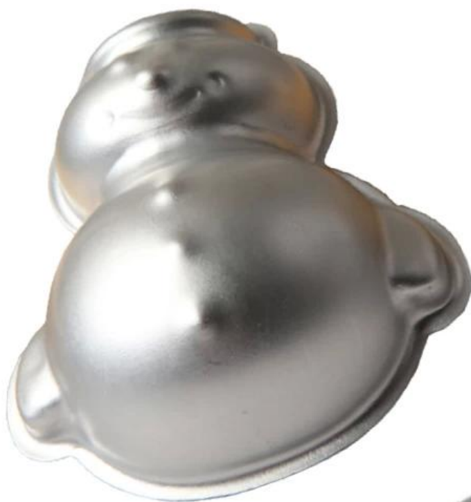
Snowman Cake Mold